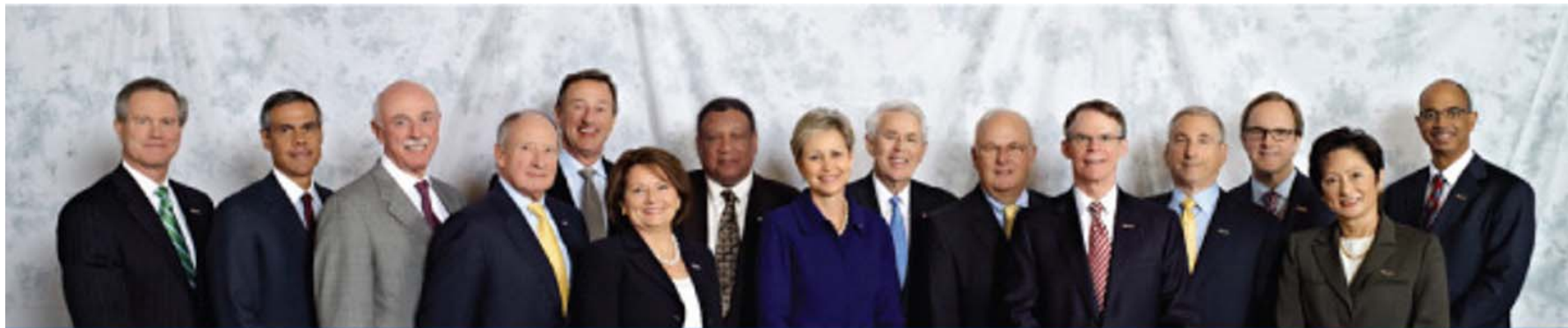
U.S. Bancorp Board of Directors